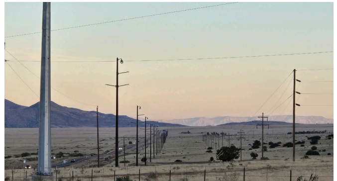
Above is the new 69 kV line that spans from Socorro to Magdalena.