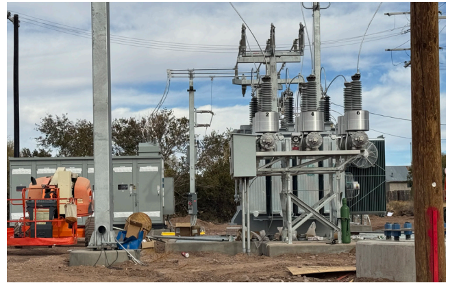
Above is the new Magdalena Substation construction.

We would like to thank our members who support us and hope that they know that we are doing our best to provide reliable and affordable electricity.