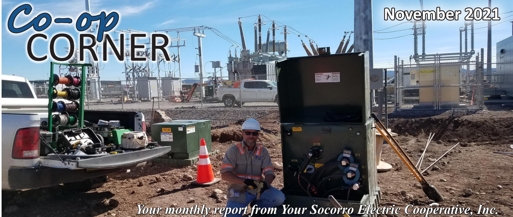
Your monthly report from Your Socorro Electric Cooperative, Inc.